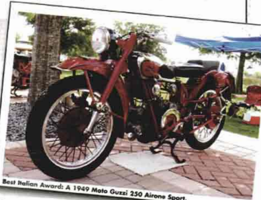
Best Italian Award: A 1949 Moto Guzzi 250 Airore Sport.

Patrons at the concours were treated to a display of antique, vintage, classic and custom motorcycles from all over the country. There was even a large collection of antique bicycles on display, dating back over 140 years. Enthusiasts from Canada, Scotland, England, South Africa, New Zealand and Australia joined their American colleagues in viewing the assembled collection and discussing the merits of the various two-wheelers. While the "Sexy Motorcycles of Italy" were featured this year, manufacturers from all over the world were represented.